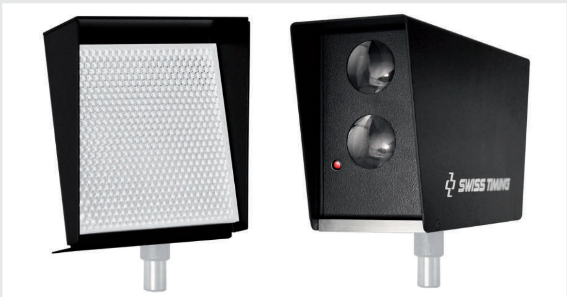
ARGES Reflex Photocell, front view with its optional Deluxe support, along with the photoreflexor

The ARGES Reflex Photocell consists of a transmitter and a reflector unit. The transmitter produces an infrared beam that is reflected on the photocell reflector, which serves as a mirror when correctly aligned opposite. Anything or anyone that crosses the field of the beam creates an interruption which is instantly reported to a timing device accordingly to meet the International Sport Federations standards. The ARGES Reflex Photocell allows a simple and constant monitoring of the cell alignment. It features an internal and accessible battery lodging and can also be connected to an external battery or a DC power supply. The two outputs contacts allow to connect the ARGES to two different timing devices simultaneously (main & back-up for example). The new ARGES Reflex Photocell also features a completely accessible DIL switch panel on the side of the photocell allowing users to choose from the many operating modes and options. The ARGES Reflex Photocell is a highly precise and reliable timing device even in extreme meteorological conditions and temperatures.